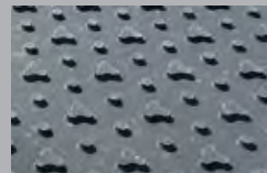
Side 1: Tire Track Surface