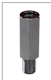
519.343NP Threaded Whip Base Non-Powered, Steel Thread Mount