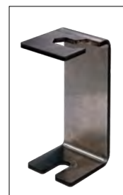
WSSM Whip Stabilizer Spring Mount Stainless Steel