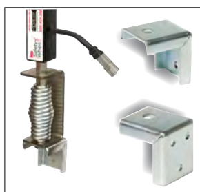
ABM: Angle Bracket Mount Attach whip to toolbox, rack or truck bed with this super duty bracket.