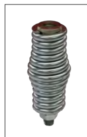
519.30BNP Heavy Duty Spring Base Mount, Non-Powered Zinc Plated