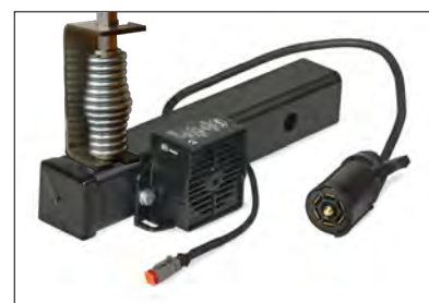
HMSDA Hitch with threaded mount, 107 dB backup alarm and external waterproof connector.